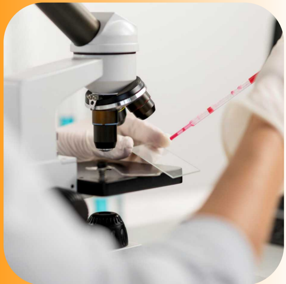
Lab Tests CBC, ESR, Serum Iron, Blood Sugar, Vitamin-D, Urine Analysis